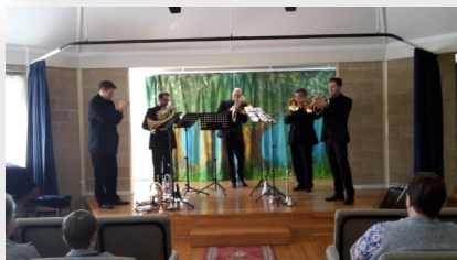
The Octagon at St Andrew's Coolah hosted Australian Brass Quintet Sunday 30th April. Another successful event

Next Service at Mendooran 11.30 am Sunday 18 June, 2017