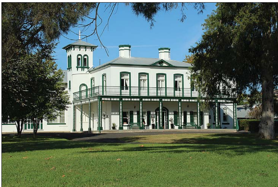
CHANGING HANDS: Historic Esrom House, administrative hub of All Saints' College. It is expected that the sale will be finalised by the end of this year.

The Presbyterian Church and All Saints' College will be working through a due diligence process over the next few weeks, but in the meantime the school leadership has offered the following assurances to the students, parents and